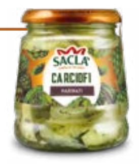
CARCIOFI MARINATI Artichoke quarters marinated with parsley