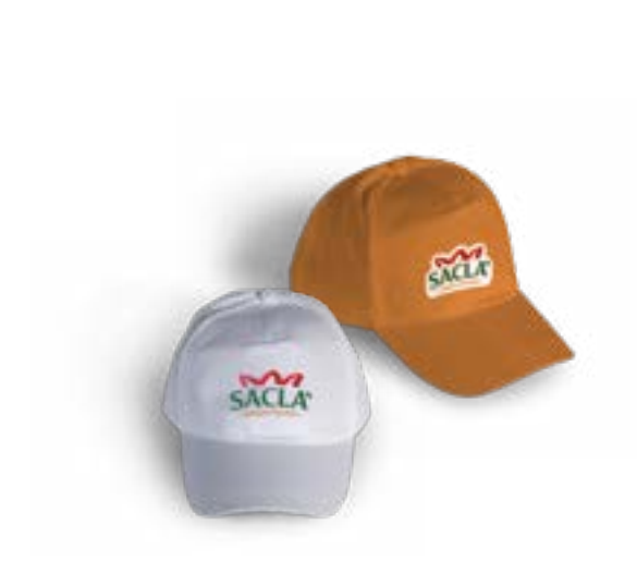
CAP WITH SACLÀ LOGO