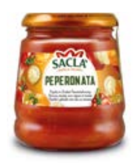
PEPERONATA Peppers with onion and tomato