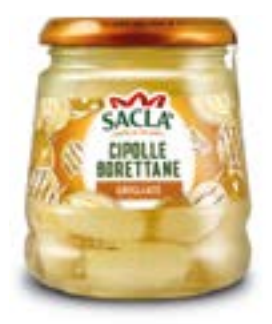
CIPOLLE BORETTANE GRIGLIATE