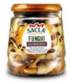
FUNGHI ALLA BOSCAIOLA